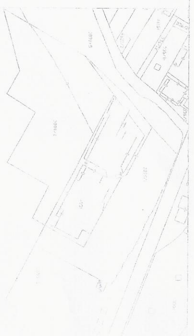
PBRIS KATASTRANSKOG PLANA K.O. PIROVAC M 1:1000

Klasa: 984-0/11-0/12 Urbroj: 511-2/11-11-2 Datum: 05.09.2011.